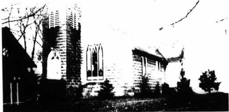
St. Olaf's Episcopal Church today.