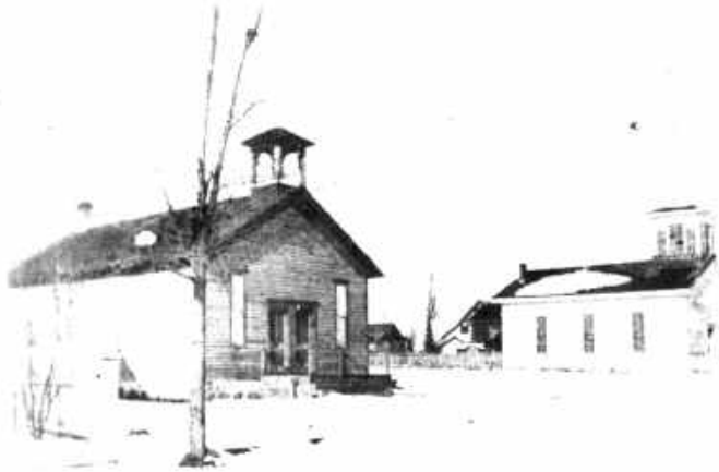
Methodist Church in background.

of the members, and to tell whether or not they have succeeded, one need to look at the beautiful structure which they have erected for their house of worship."