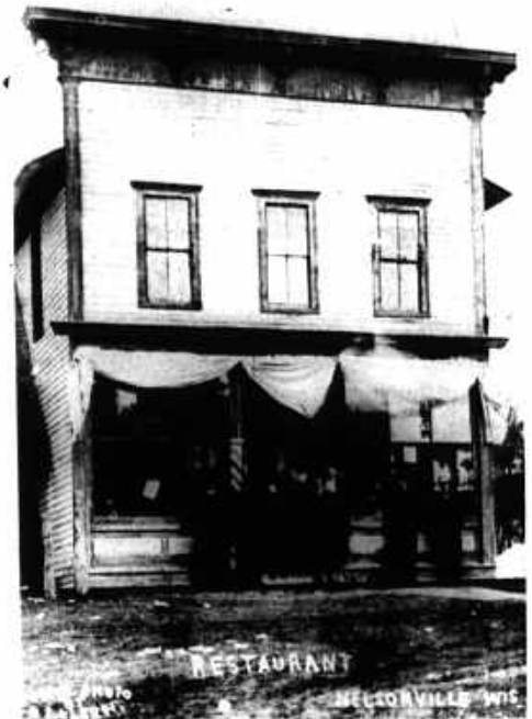
Nelsonville scene about 1908.

The best way to forget your own problem is to help someone solve his.